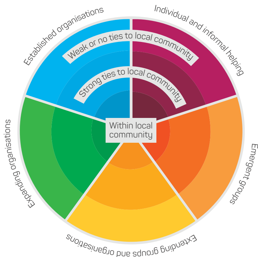
Figure 1 A framework for understanding societal responses to disasters

The bullseye is also divided into five radial segments that indicate different ways people organise to respond to disasters. 1 In a clockwise direction, they are: